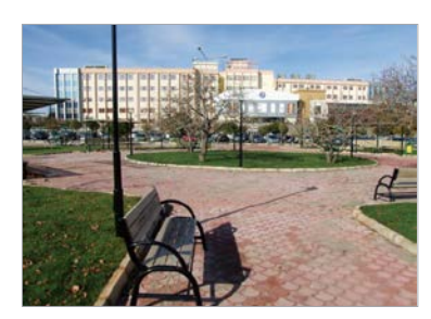
Gaziantep University Faculty of Medicine Hospital

Gaziantep University Faculty of Medicine Hospital's Central Laboratory (GAUTF-ML) Routine Biochemistry Unit has been working with an automation system since 2010 to make its workflow more efficient.