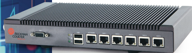
RMS Remote Application Processor (RAP) Box

Each Beckman Coulter instrument enrolled in the PROService solution is connected via an ethernet cable to a proprietary IoT Gateway device called a RAP Box. This device acts as a firewall to all the connected instruments to control incoming and outgoing traffic. It has built-in intelligence and security hardening that securely enables remote sessions with Beckman Coulter associates.