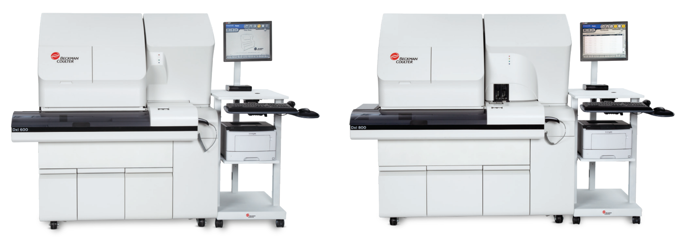
UniCel DxI 600 Access Immunoassay System