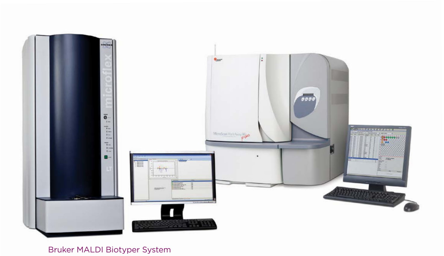
Bruker MALDI Biotyper System